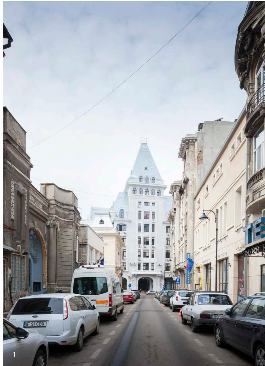
1 Fațadă Corp A Unit A Facade